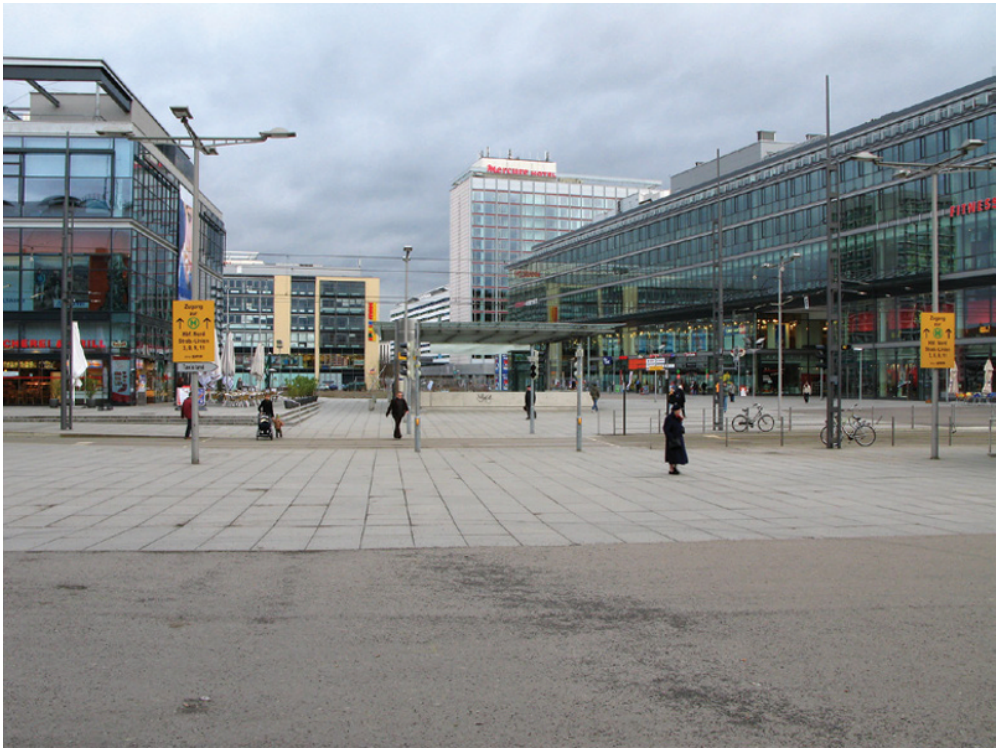
Figure 1.1 Treeless square – cold, hard, unwelcoming, and easily overheated in summer.