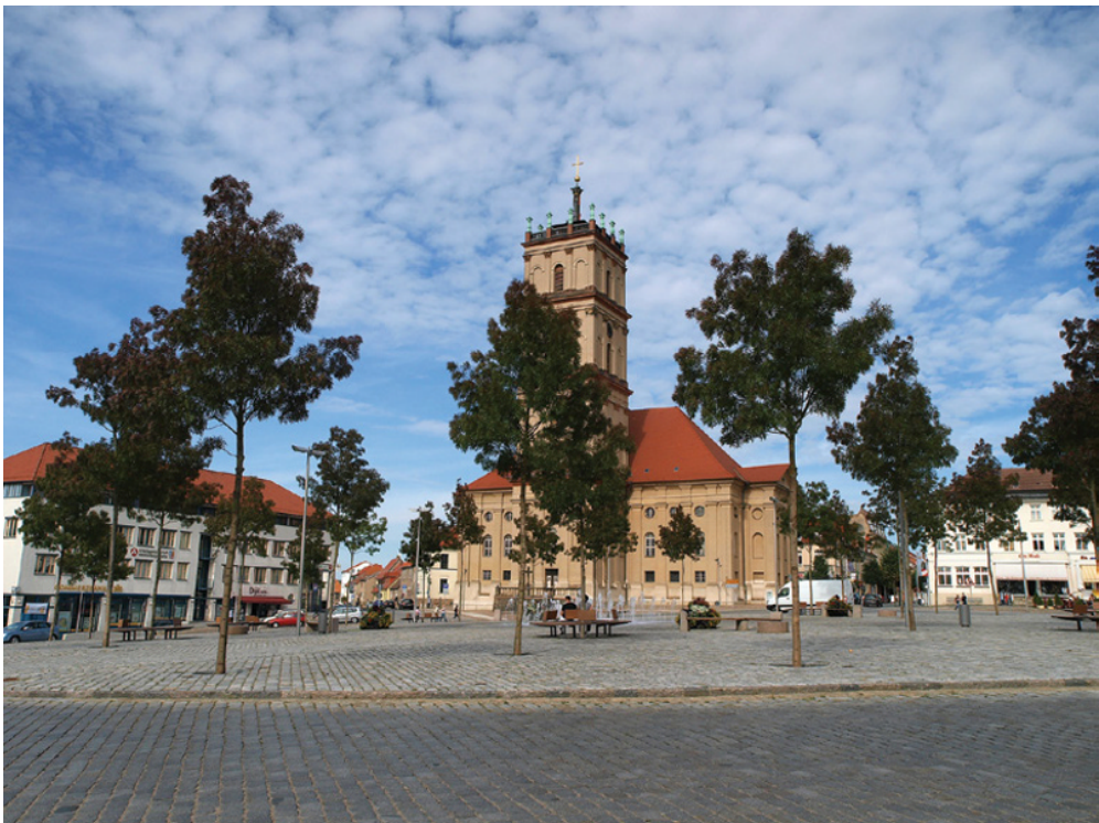
Figure 1.2 Square with trees ( Fraxinus angustifolia ) – segmented, warm, inviting and shady.