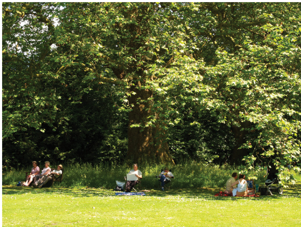
Figure 1.4 Relaxing under a tree ( Castanea sativa ) in a park in Cornwall, UK.

the shade of trees (a popular custom in many cultures). Parks may therefore also be called “therapeutic landscapes”, and a movement called “garden therapy” is currently on the rise. Gardens (including allotments) are increasingly seen as personal spas, as a place where people can feel comfortable and relax – gardening as private health care.