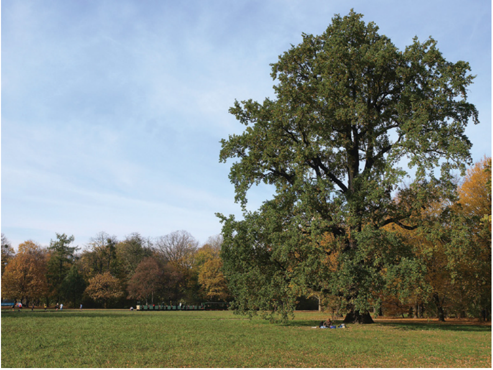
Figure 1.7 A park that has been landscaped to resemble a savannah, including stretches of lawn with individual trees and edges of woods.

Aspects of ancient religions often revolve around trees, such as the “tree of forbidden knowledge” at the beginning of the Bible, when Adam and Eve are expelled from Paradise after eating its fruit. Other examples are the giant ash Yggdrasil in Norse religion, or Buddha’s Tree of Enlightenment. Even today, the symbolic and spiritual importance of trees can be deduced from the coins of many countries that show trees or leaves. Songs, literature, poetry and fairy tales often revolve around trees. Many ancient stories tell of people who are turned into trees.