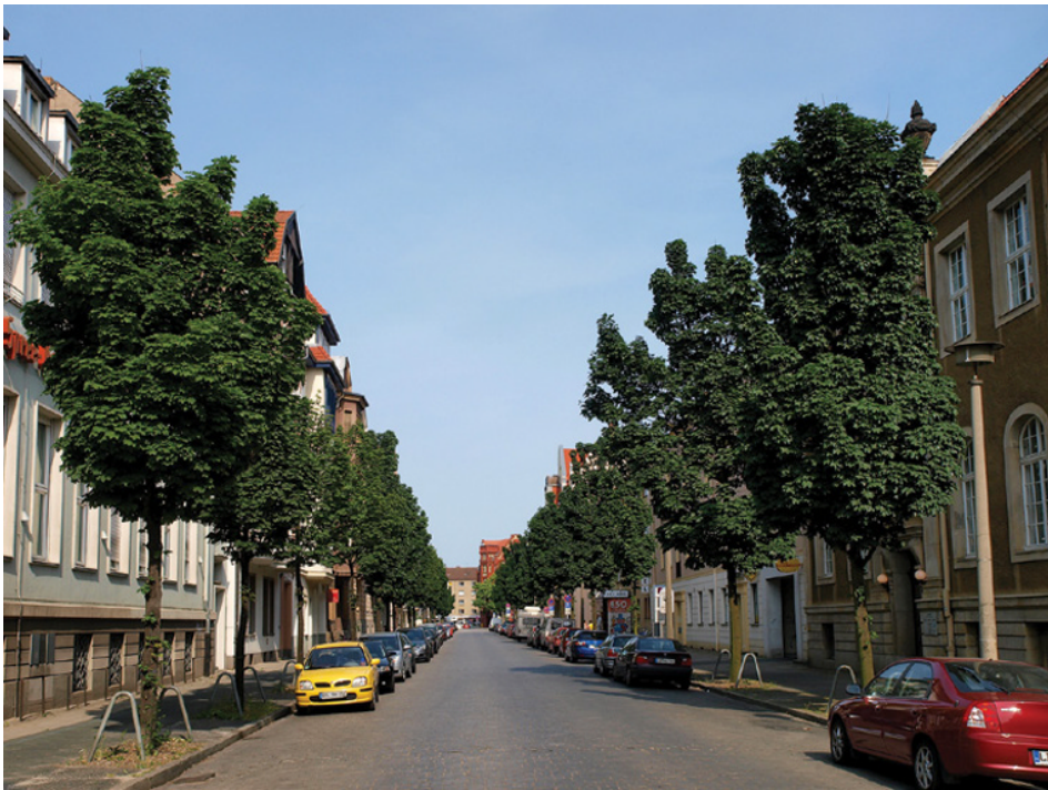
Figure 1.9 Road-side trees ( Acer platanoides ) with a strong positive effect on the quality of living.

Color psychology studies the effect of colors on the psyche. According to its position in the chromatic circle, the green of leaves has a balancing and calming effect. It induces harmony, inspires, stabilizes, improves our self-esteem and makes us yearn for (the lost) paradise. This is another reason why woods and parks have such a relaxing effect on us.