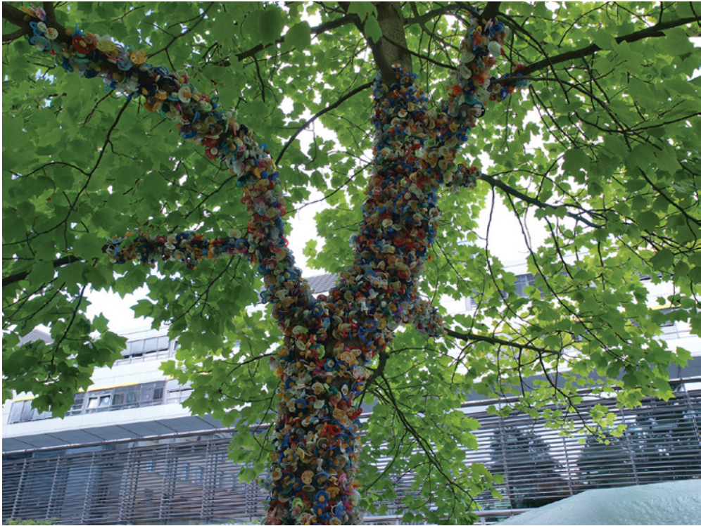
Figure 1.5 Dummy tree ( Liriodendron tulipifera ), to help children wean off their pacifiers.