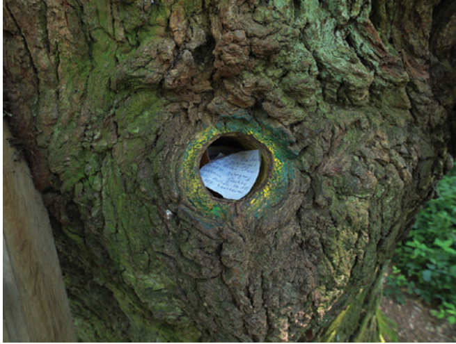
Figure 1.8 The “letterbox” of the “Flirt tree” ( Quercus robur ), used for searching for a partner.