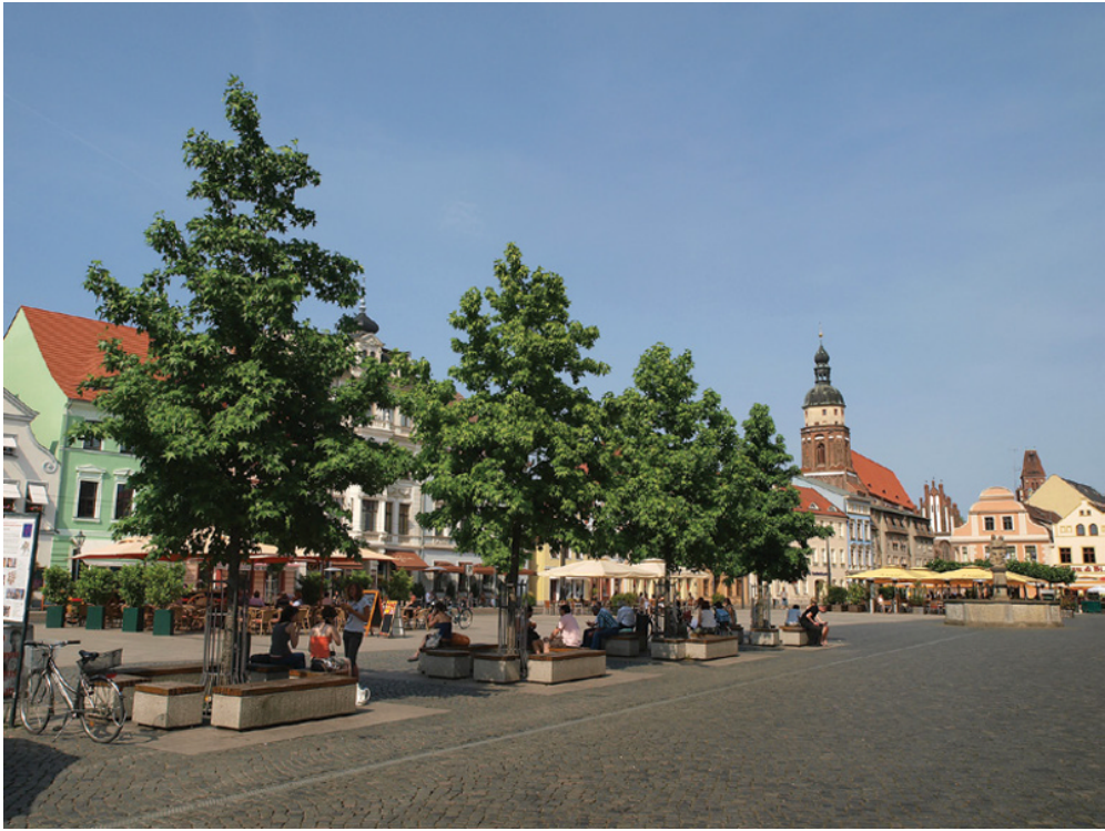
Figure 1.10 Desired shading by urban trees ( Liquidambar styraciflua ) on a hot summer day.

Bowler et al. , 2010). City trees equalize extreme temperatures. They contribute to cooling and shading (Figure 1.10), which is perceived as pleasant. While temperature differences between parks and areas covered by buildings or concrete may be measured at up to 5°C, the perceived difference in physiologically equivalent temperature (PET) is usually much higher and may reach more than 10°C (due to the increased humidity under trees). The difference in surface temperature between asphalt and tree-covered greens is even more extreme (up to 15°C).