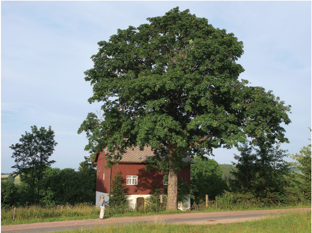
Figure 1.3 House tree ( Acer pseudoplatanus ) – often a member of the family.

Trees are also increasingly important for our health – for instance, visits to parks (municipal, spas and civic parks) and gardens, walks and hikes, resting on a bench under a tree, picnics in