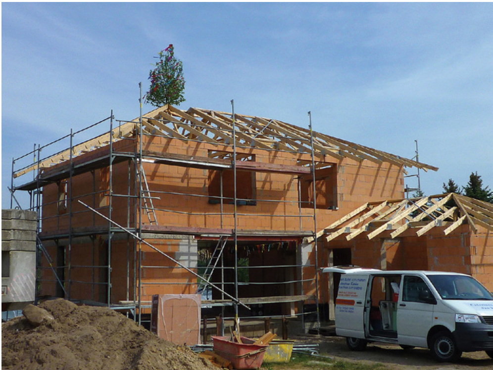
Figure 1.6 Betula pendula tree in a roofing ceremony – a decoration very popular in house building.